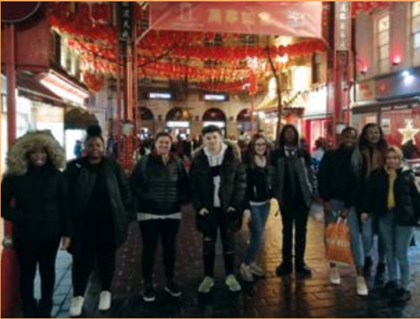
– Young people from Hackney of Tomorrow celebrated Chinese New Year together in China Town!

came shared some traditional Vietnamese food and received a red envelop for good luck.